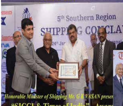
Honorable Minister of Shipping Mr. G. R. VASAN presents "SICCI & Times of India" - Award