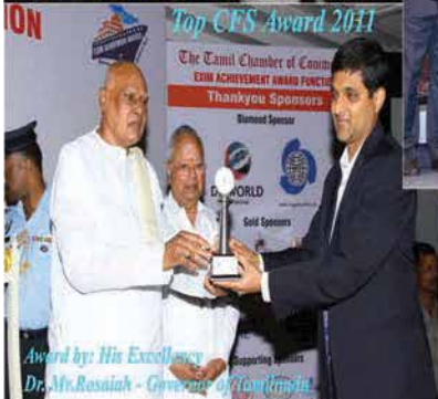
Top CFS Award 2011