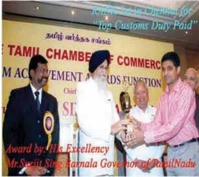
Special Award in Chennai for "Top Customs Duty Paid"