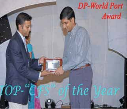
DP-World Port Award