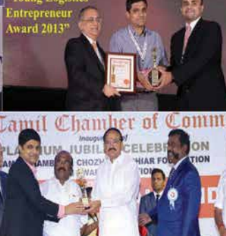
"Young Logistics Entrepreneur Award 2013"