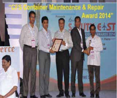
"CFS Container Maintenance & Repair Award 2014"