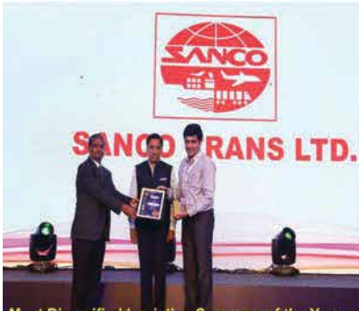
Most Diversified Logistics Company of the Year Award - 2018