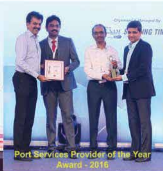
Port Services Provider of the Year Award - 2016