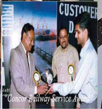
"Concor Railway Service Award"