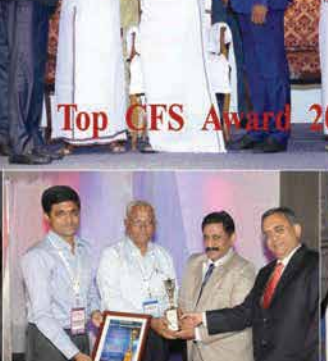
Top CFS Award 2018