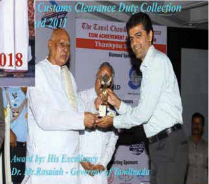
Customs Clearance Duty Collection Award 2011