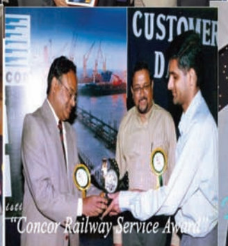
"Concor Railway Service Award"