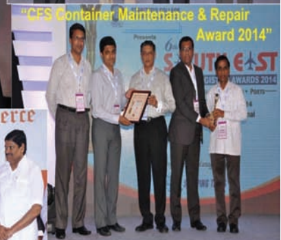
"CFS Container Maintenance & Repair Award 2014"