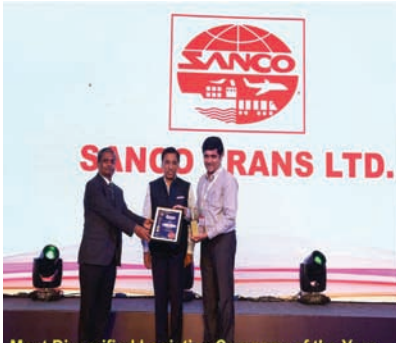
Most Diversified Logistics Company of the Year Award - 2018