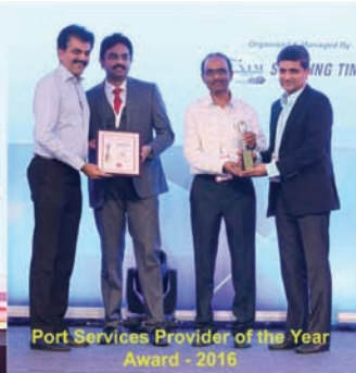
Port Services Provider of the Year Award - 2016