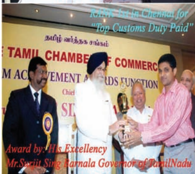
Award by: His Excellency Mr. Surjit Singh Barnala Governor of TamilNadu