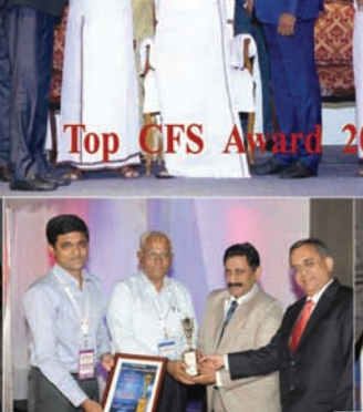
Top CFS Award 2018