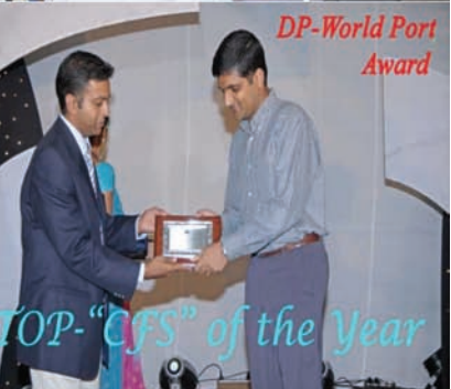
TOP-"CFS" of the Year