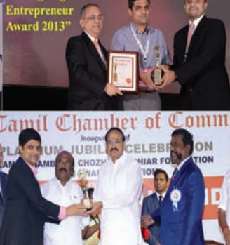
"Young Logistics Entrepreneur Award 2013"